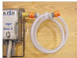
P/N 0800453 6 Ft. High Pressure Hose w/Quick Release Connector