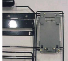
Backing Plate Mounted