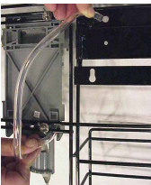
Back View of KP1H Portable