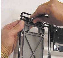
Back View of KP1H Portable