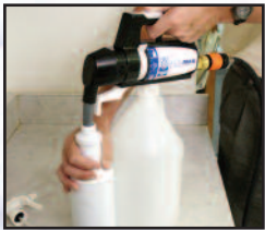
Low flow Bottle fill (1 GPM)(3.8 LPM)