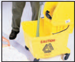
High flow Bucket fill (4 GPM)(15 LPM)