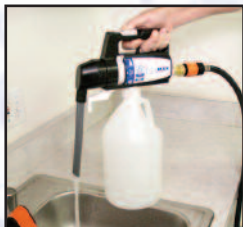
4 GPM (15 LPM) water rinse setting to flush spout for incompatible chemicals or dispense water